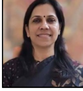
Ministhy S I.A.S. Commissioner State Taxes Uttar Pradesh